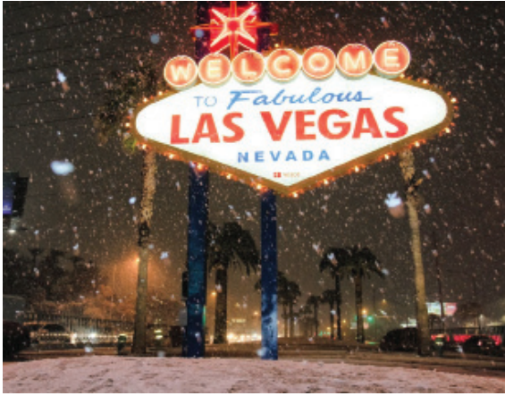
AT LEFT: A rare snowfall blanketed Las Vegas during the International Builders Show.